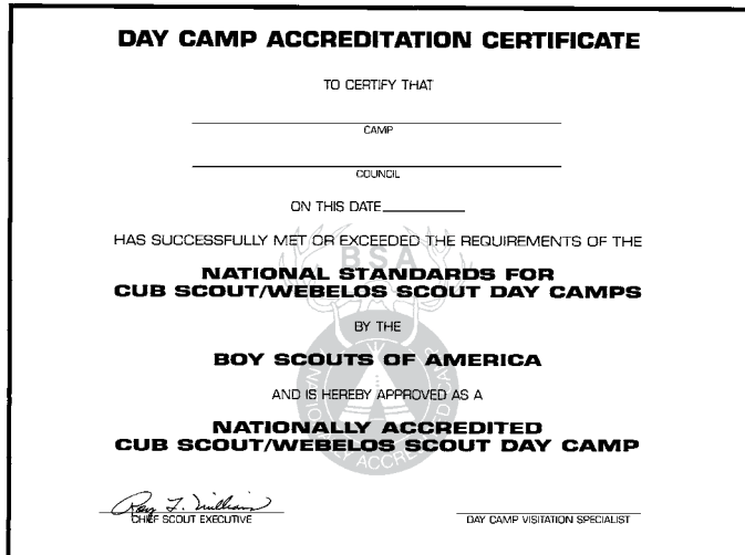
Day Camp Accreditation Certificate, No. 13-110

The Scout executive sends a copy of the score sheet to the regional office.